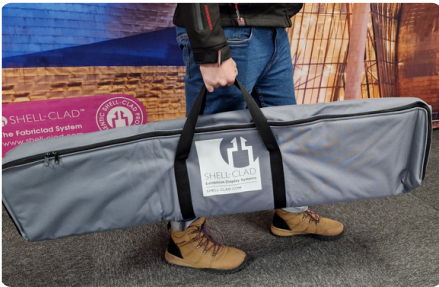
PACKS INTO CARRY CASES